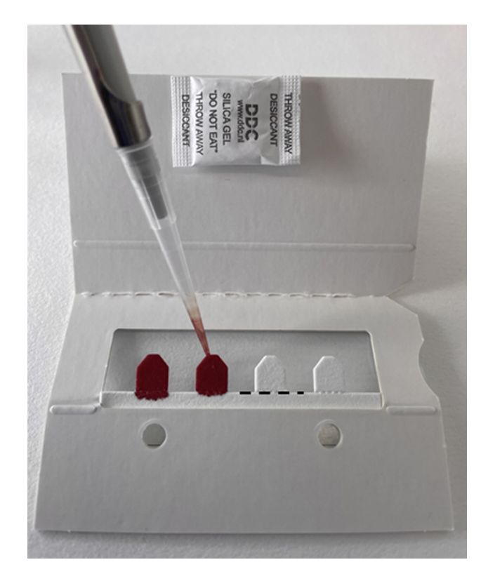
Figure 1. Design of the new volumetric filter paper cards (DBSV) with a paper comb with teeth and a perforation for detaching the teeth. The folding mechanism and the cover with a silica desiccant gel packet provide faster drying and protection of the samples during transport (a colored figure is provided online). The dashed line shows the perforation line where the teeth can be detached for the analysis.

fingertip. Additionally, external accuracy controls from ACQ Science (Rottenburg-Hailfingen, Germany) were added, two samples spiked with PEth 16:0/18:1 only and one authentic sample containing PEth 16:0/18:1 and PEth 16:0/18:2. The lyophilized samples were reconstituted according to instructions and pipetted to both types of cards in the same manner as the venous whole blood samples.