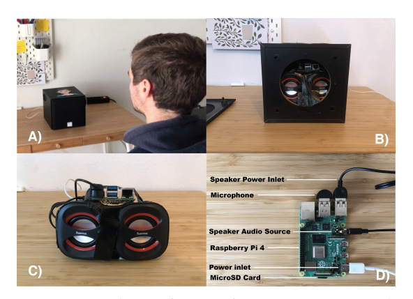
Figure 1: Detail view of Lena – A) Patient interacting with Lena. B) Front-view of Lena with open front. C) Front-view of Lena without its housing. D) Raspberry Pi 4 with all the connected components.

tinuously improved and eventually integrated into one system.