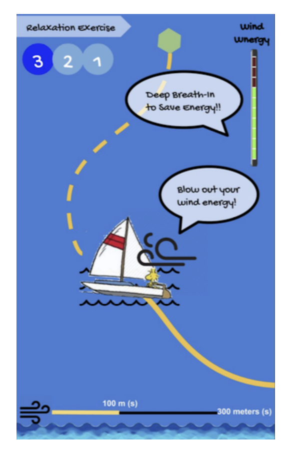
Figure 2: Draft of the App's User Interface

To ensure consistent and evidence-based instructions on how to perform a slow-paced breathing training, an instructional video clip was produced with the help of the involved obesity experts. This video clip would be presented to the user before she or he would perform the self-regulation training with the app for the very first time. The clip explains in ca. 30s how a deep abdominal breathing is conducted and instructs the audience to inhale through the nose and to exhale through the mouth while performing circa six breath cycles per minute [25].