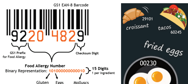
Figure 2. Left: 5-digit food allergy number as a GS1 EAN-8 barcode. The binary representation of the number allows to encode the existence ('1') or absence ('0') of the food ingredients. Right: Example of an enhanced menu card.

shortness of the number, it can also be printed without the related barcode, as shown in Figure 2, right.