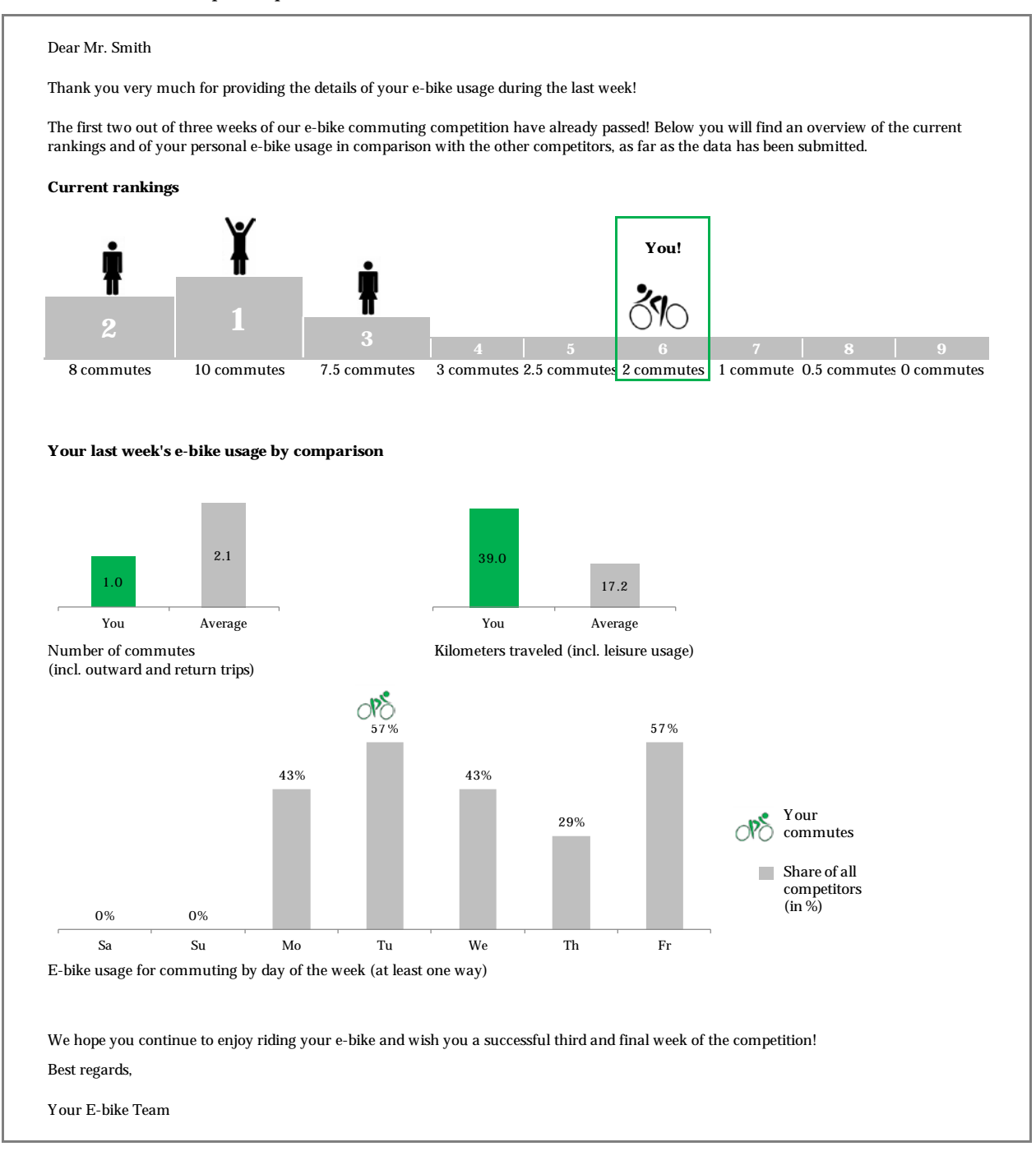
Figure 1. Feedback provided to participants of e-bike commuting competition (translated from German)

competition at the end of each week and a comparison of their own e-bike usage during the past week with that of the other participants.