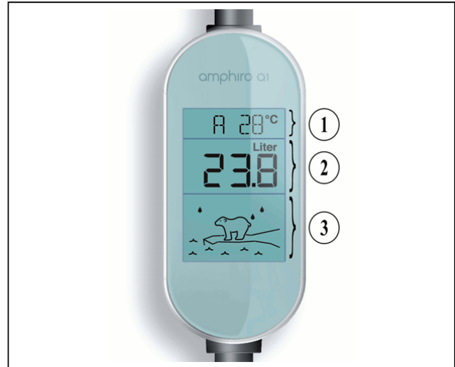
Figure 2: Amphiro shower smart meter showing the current energy efficiency class [rated from A to G], temperature [ ^{\circ} C], water volume [liters] and a polar bear animation. As soon as the water flow stops, water and energy consumption [(k)Wh] toggle.

Figure 2 shows the display of the device. It is a low power LC display with 112 segments. During the shower, the top of the display (1) changes every three seconds between the temperature and the energy efficiency class. Also in a toggling manner, the largest digits in the middle of the display (2) are used for the volume and the heat energy. At the bottom of the display (3), the polar bear and the ice shell are located. Once the extraction of water stops, the top of the display (1) stops toggling and now only shows the energy efficiency class.