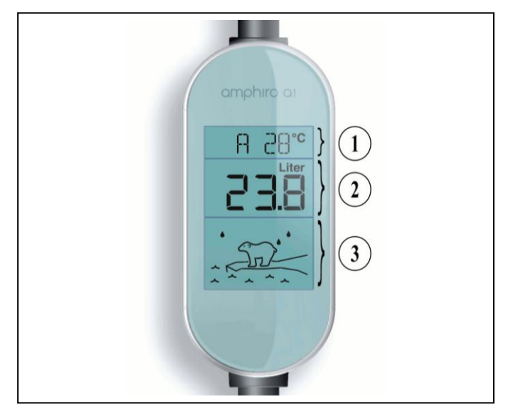
Figure 2: Amphiro shower smart meter showing the current energy efficiency class [rated from A to G], temperature [°C], water volume [liters] and a polar bear animation. As soon as the water flow stops, water and energy consumption [(k)Wh] toggle.

Figure 2 shows the display of the device. It is a low power LC display with 112 segments. During the shower, the top of the display (1) changes every three seconds between the temperature and the energy efficiency class. Also in a toggling manner, the largest digits in the middle of the display (2) are used for the volume and the heat energy. At the bottom of the display (3), the polar bear and the ice shell are located. Once the extraction of water stops, the top of the display (1) stops toggling and now only shows the energy efficiency class.