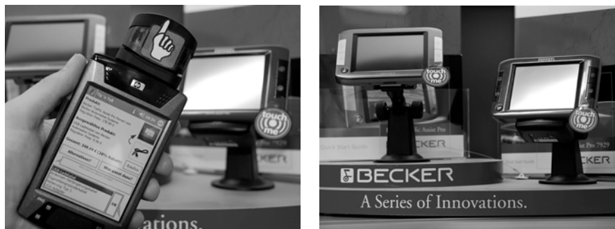
Figure 2 Consumer using an RFID-enabled mobile device within a retail store selling mobile navigation units